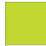
PMS 382 C